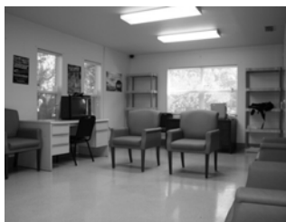
Interface East re-opened at the newly-renovated shelter in Palatka. On December 13th, 2007 CDS Board members toured the new facilities